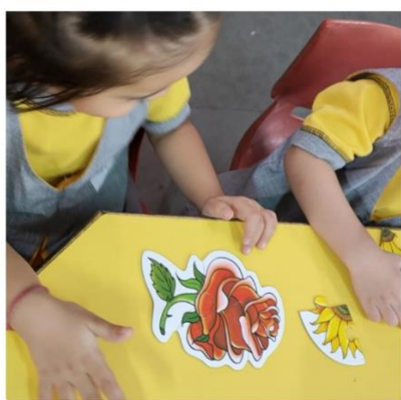
COTTON WOOL COLLAGE